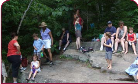
A group picture on the rocks

Ontarians would normally experience in August. A gentle rain that night eventually brought the temperature and humidity down to more comfortable levels.