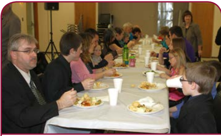
Ottawa brethren enjoying a meal together.

On April 5 in Kemptville, Ontario, 19 people gathered together as a full moon slowly rose through a scattering of clouds. As the golden shafts lit the sky above, people bowed their heads in acknowledgment and prayer as they thanked God for the wonder of His Son's last Passover and its meaning - the symbolism wrapped up in the partaking of wine and unleavened bread. The beauty and wonder of this great gift had been preceded by the foot-washing ceremony - a tremendous lesson in humility through Christ's example. Carried down through millennia we symbolically, once again, repeated this great event. For some this would be their 45th time coming together in giving thanks for the wonder of God's great love bestowed upon us.