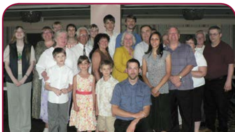
Our New Brunswick brethren after services