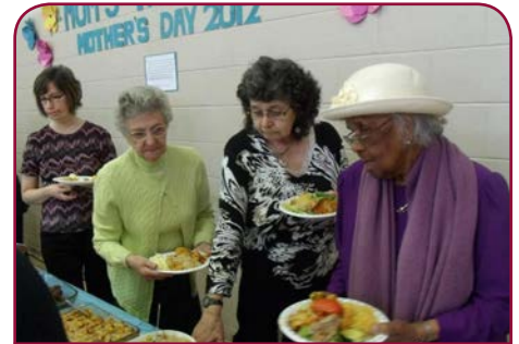
Toronto honours Mothers

treated to beautifully wrapped gift of toiletries and an assortment of delicious Lindt chocolates. Inspiring scripture verses were strategically placed at the opening of each package.