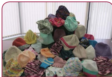
Handmade caps ready to be donated

Cancer: a word that nobody wants to hear. Unfortunately, it is a fact of life for many people. After a diagnosis, many people choose to undergo treatment that requires courage and patience. There are many side effects to chemotherapy and hair loss is just one of them.