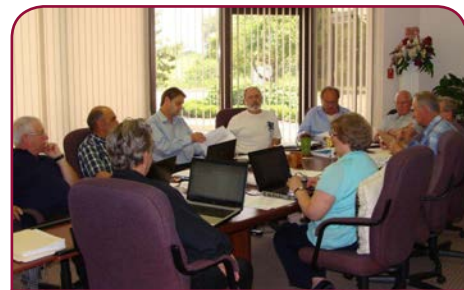
National Council meeting in Toronto