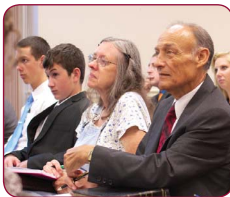
Dana Moss Photography

Three specific words are used each time God reminds us that the feasts, His feasts, are to be observed. So let’s take a close look at God’s instructions. “These are the Feasts of the LORD, even holy convocations, which you shall proclaim in their seasons” (Leviticus 23:4). The word “holy” in this verse refers to “a sacred place” or “thing.” The Hebrew is quodesh , from the prime root meaning “to observe as ceremonially or morally clean.”