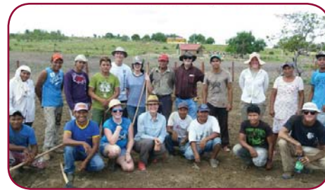
provided by Megan Garant

After a long and hot day as temperatures were running around 30C, we came back to the camp for a relaxing evening of fellowship and games with the local brethren. The locals spent most of the evening playing guitar and singing.